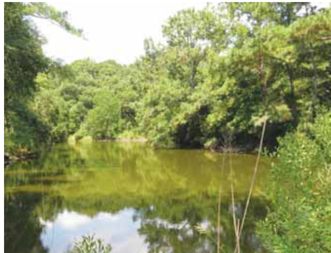
Pond on Frogmore Plantation

To the south, the Britton family placed a conservation easement on their 48-acre property, part of historic Jackdaw Hall Plantation. The Britton land has frontage on Frampton Creek and on Botany Bay Road, and it adjoins Botany Bay Plantation and another eased property, the McCollum-Bat-