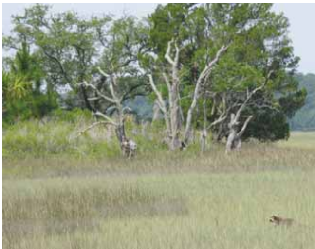
Raccoon crossing Mikell marsh to hammock

The Store Creek conservation hub continued to grow in 2009 to encompass Pinkney Mikell's 184-acre Peters Point Plantation property, which lies across Store Creek from preserved Bailey Island. This land, which has been farmed for 300 years by the same family, contains maritime forest and expansive marshlands with several large hammocks (an area of highland within the marsh).