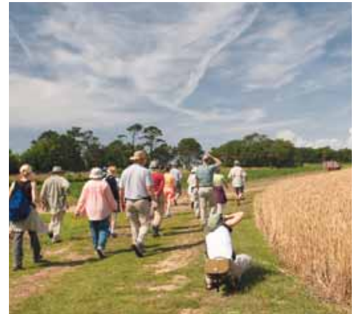
Back to Nature 2009