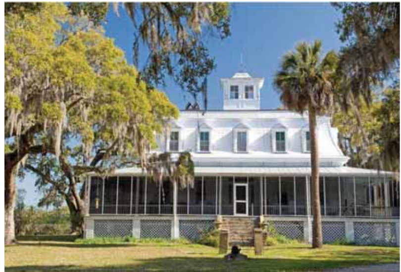
Sunny Side Plantation on Store Creek

Directly opposite Sunny Side across Store Creek the Hastings family protected 140 acres of historic Governor's Bluff Plantation. This heavily-wooded property has almost a mile of creek frontage.