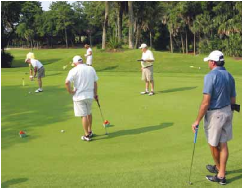
Golfers putting around tomato baskets on the green

The tournament was a rousing success, with 60 players competing in teams and taking their chances at hole-in-one prizes that included a Scout boat and Honda Accord. After tournament play and catered lunch, there was a raffle prize drawing and a live auction for prizes that included exotic vacation trips and a helicopter tour of Edisto Island.