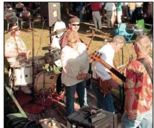
RIGHT: The Edisto Gumbo Band, seen here at 2009 event, will once again perform pro-bono on November 14! ■