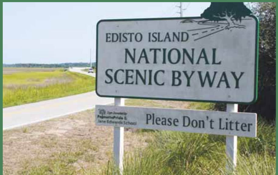
Gateway sign at the entrance to the Edisto Island National Scenic Byway

Have you noticed the new Edisto Island National Scenic Byway sign? It's nestled in wax myrtles on the side of the road as you approach the Dawhoo River Bridge coming onto Edisto Island. After months of working on the design, EIPA (Edisto Island Preservation Alliance) has installed the gateway sign in its new home! Funds for the sign were donated by Jane Edwards School, which was awarded a Palmetto Pride grant for the purpose of enhancing the scenic view shed and encouraging the public to keep the corridor litter-free. Other news along the Edisto Island National Scenic Byway -- work begins soon on replacing the bridges over Sand Creek, Russell Creek, and Store Creek, and EIOLT was recently awarded special recognition by the Governor's SC Scenic Highway Committee for its leadership in attaining the national designation for Highway 174. ■